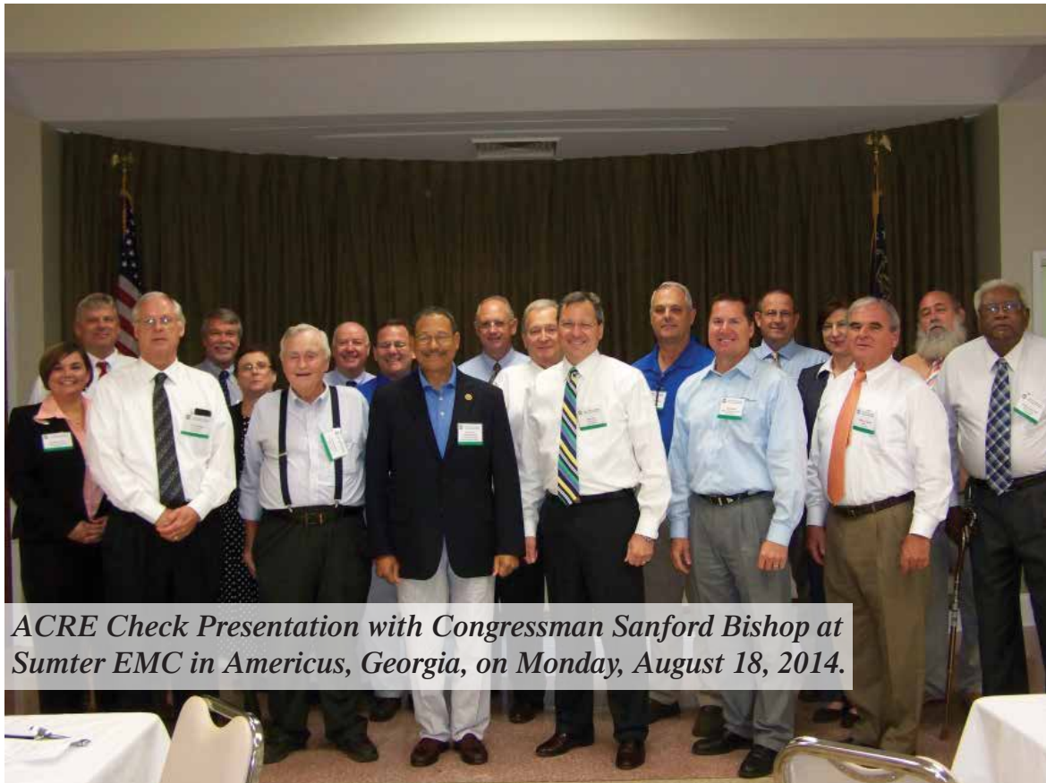
ACRE Check Presentation with Congressman Sanford Bishop at Sumter EMC in Americus, Georgia, on Monday, August 18, 2014.